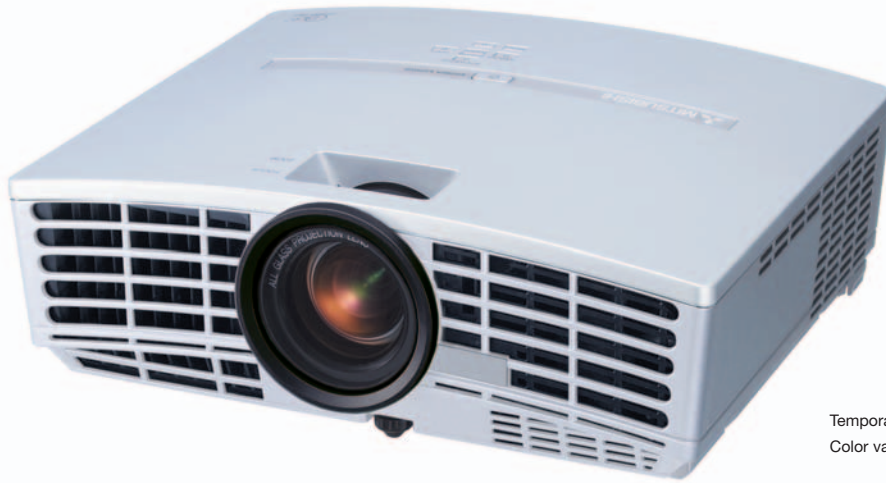
Temporary product image. Color variation possible.

The new standard for everyone who dreams of high-resolution pictures in greater depth: the Mitsubishi HC3000. Compatible with HDTV (High Definition Television) and equipped with the new Dark Chip 3™ from Texas Instruments. Now you can experience your movies in better brilliance than ever, with deeper black levels and images that come to life in best dimensions. Together with 4000:1 contrast and 1000 ANSI lumens, these qualities add up to give you strikingly sharp and vibrant pictures true to every detail.